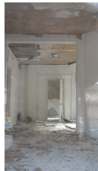
Would you pay $180,000 for this property? This property is one of many sold in Jordan and on the Northside through fraud and use of a stolen identity.

If the house is noisy, unkempt, overgrown weeds, litter, unshoveled sidewalks, illegal activity. You have a right to live in a safe, quiet and clean community, and we have a responsibility to do our part in respecting and insuring everyone’s rights are enforced. If not you than who, if not now then when?