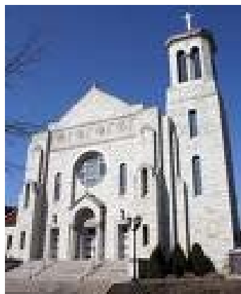
Hidden Treasures The Church Bells of Saint Anne's, nice to hear the bells in the community again.